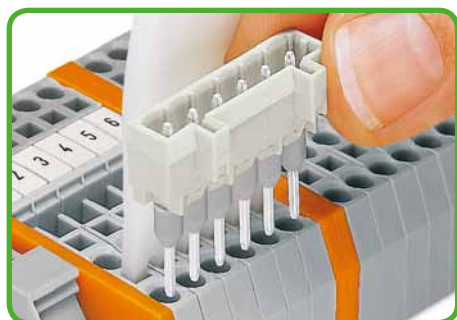
Inserting a male connector with long contact pins into a front-entry rail-mounted terminal block via 6-pole operating tool.