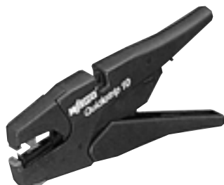
Cat. No. 206-101