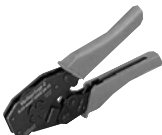
Cat. No. 206-204